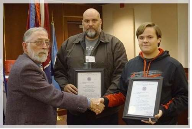
Say hello and make them welcome.